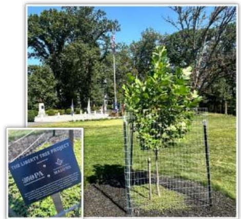
This Liberty Tree was planted at the Masonic Village in Elizabethtown, PA.

Generously sponsored by and in partnership with the Pennsylvania Freemasons, America250PA's Liberty Tree Project includes a certified Liberty Tree planted in each of Pennsylvania's 67 counties beginning in the Fall of 2021, through 2026.