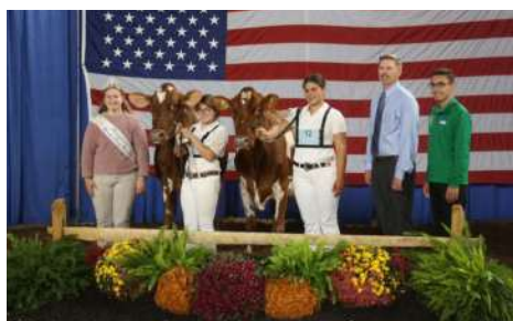
It was an exciting day at the State Dairy Show as it was my first time ever attending this event.