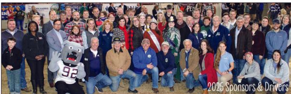
2025 Sponsors & Drivers