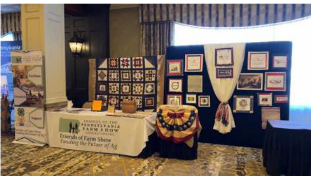
The America250PA Quilt Project traveled to the PA Fair Convention held at the Hershey Convention Center.

The quilt will be traveling to select Pennsylvania Fairs and events during the 2025 fair season. If you would like more information about the America250PA Quilt Project or how to purchase raffle tickets, please email: lbailey13@comcast.net or call 717.254.9550. Visit the www.friendsoffarmshow.com and click on the America250PA link.