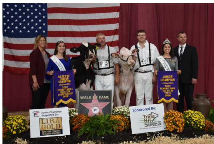
2022 All-American Holstein