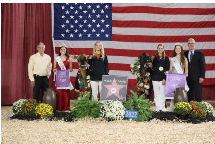
Supreme Heifer and Cow