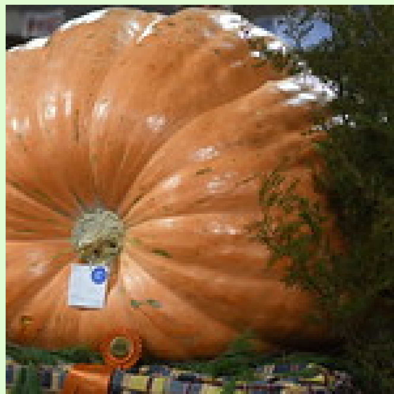
John Rauch of New Tripoli, Lehigh County placed Best of Show with his extra large pumpkin in the Field Vegetable Entry in January 2020.

The Farm Show has close to 150 vegetable classes to