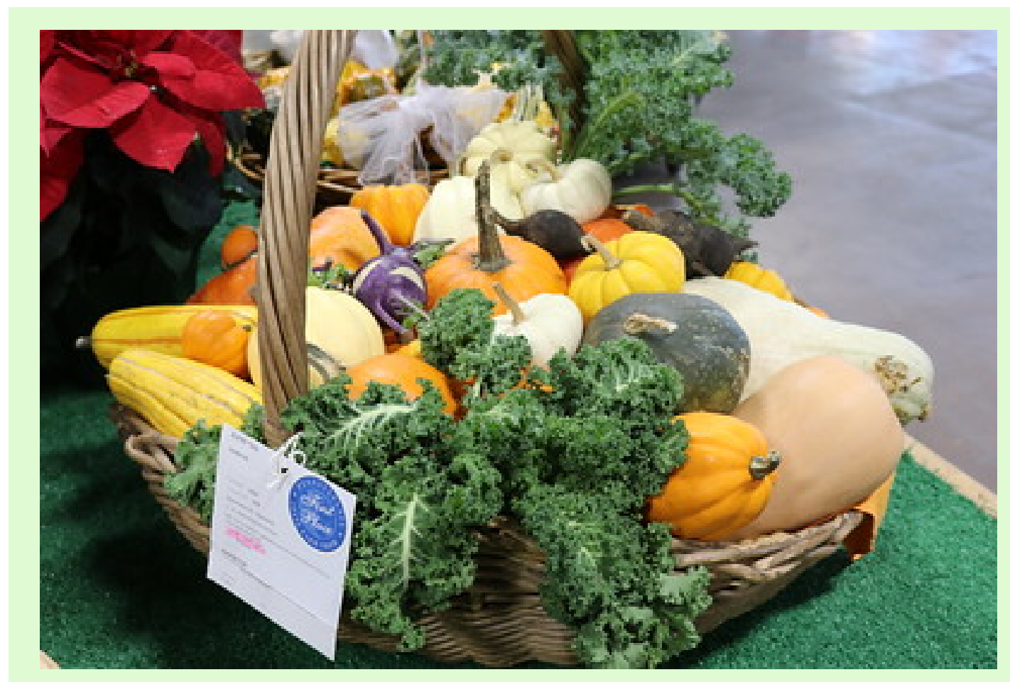
Beautiful arrangement of vegetables at Farm Show.

If a traditional garden isn't possible for where you live, maybe a container garden might be a great solution. Container gardens should also be planted at this time as well. Choosing the perfect container and the correct seeds for the size container is often the most important decision in this growing environment. Container gardening can be the perfect start for youth exhibitors looking to get their hands dirty!