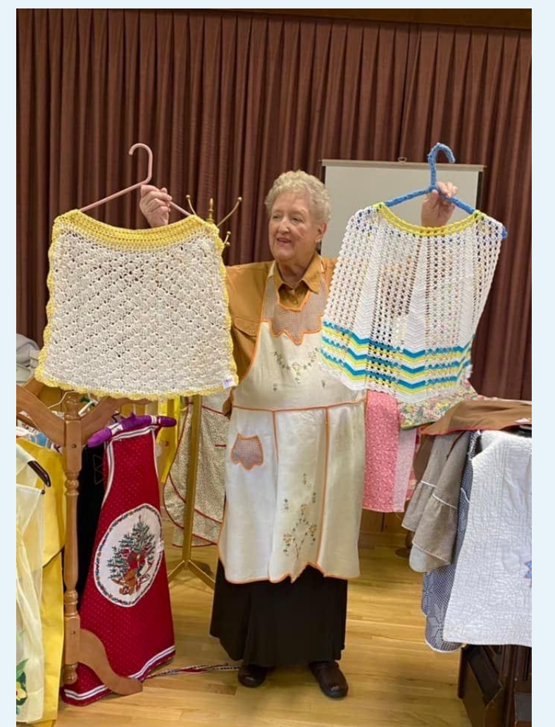
Two beautiful examples of the handcrafted crocheted aprons.