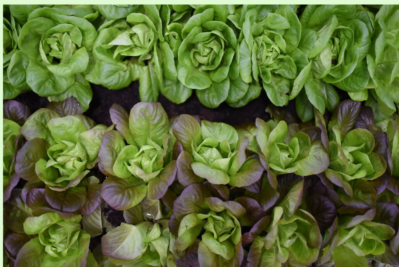
Lettuce on display at the PA Farm Show 2022. Farm Show Vegetable entry Deadline is Jan. 4, 2023.

Happy growing! We look forward to seeing what you produce and enter at the 2023 PA Farm Show!