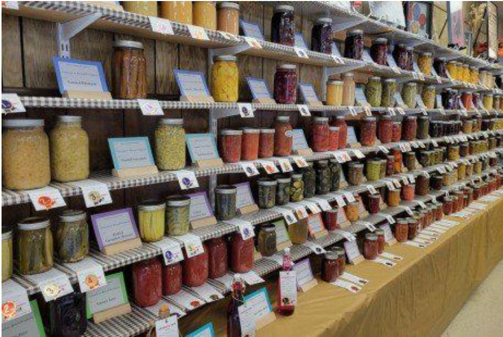
Canned goods.

Senior Extension Educator and Team Leader, Food Safety and Quality, Penn State Extension